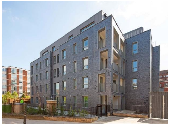
Example of refurbished homes in Hackney

Soon Riverside Housing will be writing to Samuda residents to let the know what the revised timetable for the consultation will be.