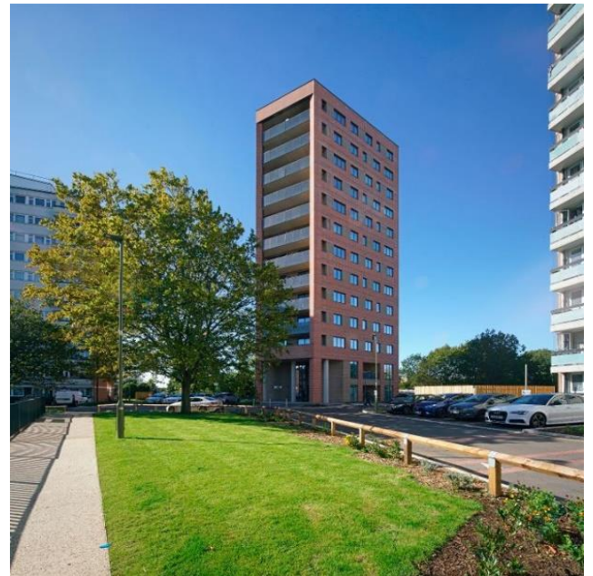
Example of new "infill homes" where new blocks are intermingled with refurbished homes in Barnet

Riverside Housing have a website with all the details about the consultation. You can find out more at www.futuresamuda.co.uk .